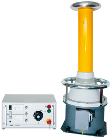
The figure is illustrative.